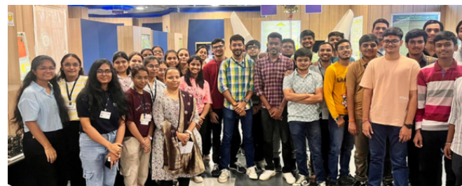
(Students @ VSSE)