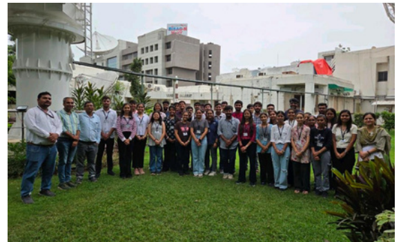
(Students @ BISAG for Industry visit)