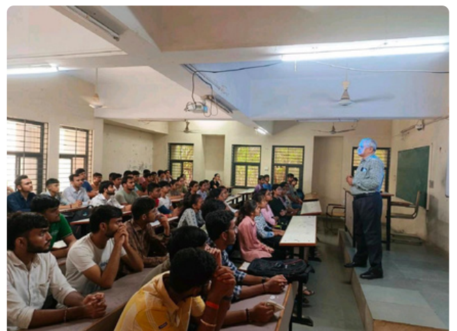
(Effective Listening Workshop)