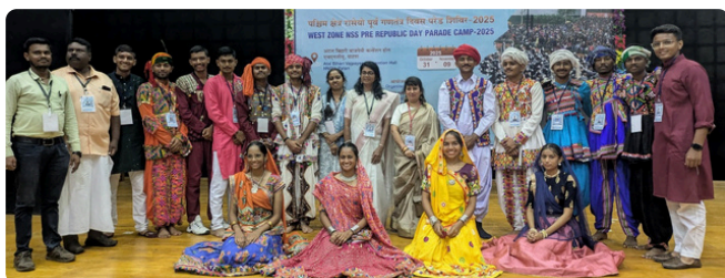
(West Zone Pre RD Camp)