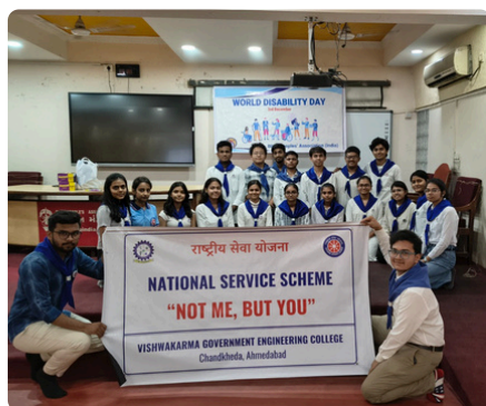
(NSS Day Celebration)