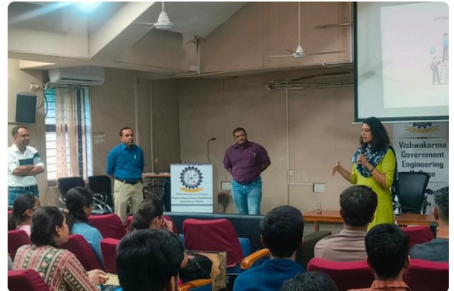
(Entrepreneurship and Innovation Workshop)

The session inspired students to explore innovation-driven career paths.